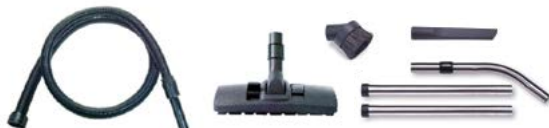
Accessory kit NS1

High-quality and robust accessories with stainless steel wands and floor metal plate (floor nozzle).